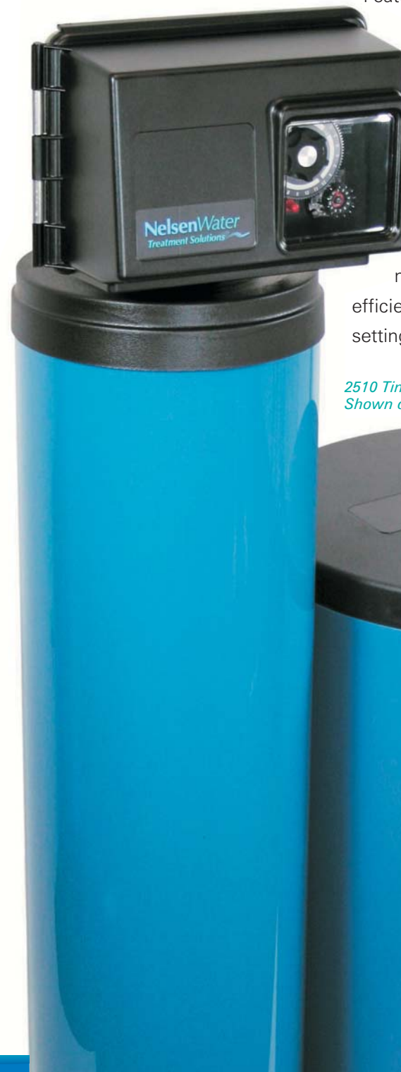
2510 Timeclock Control Shown on Softener