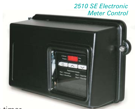
2510 SE Electronic Meter Control

The 2510 SE Electronic Meter Control provides your home with conditioned water based on your family's water usage, regenerating only when needed. This environment-friendly control ensures you years of soft water; saving you money, water and regenerant.