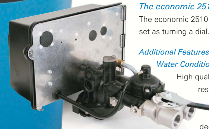
2510 Mechanical Meter Control (shown with Optional Bypass)

High quality, cation water softener exchange resin. Tough, high density, polyethylene salt storage tank. Additional features available to match any decor. Full five year control valve warranty, Ten year tank warranty. Electricity cost per month is approximately 10 cents.