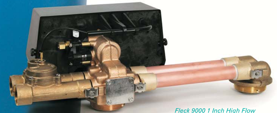
Fleck 9000 1 Inch High Flow Capacity Control Valve