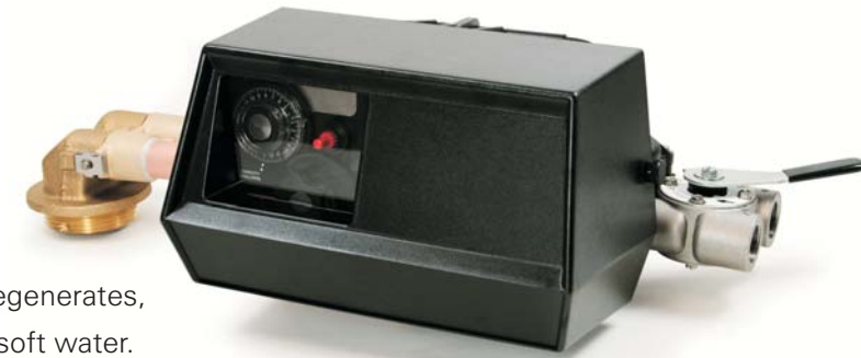
Fleck 9000 Mechanical Control Valve

the second tank is in service, the first tank regenerates, giving you all the advantages of continuous soft water.